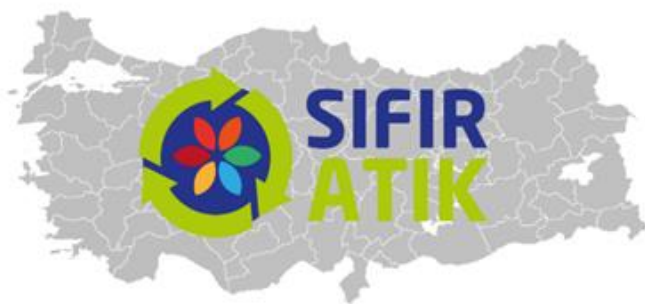
Zero waste project, Ministry of Environment and Urbanization, Turkey