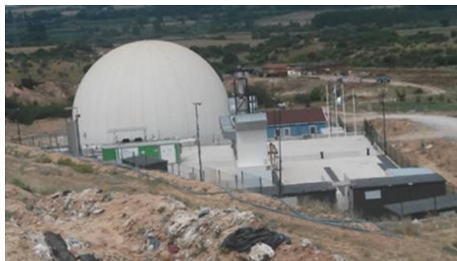
Kirkclareli Local Government Union of Construction and Operation of Solid Waste Facilities (KIRK KAB), Turkey

In order to achieve these goals, it is necessary to change the organization of waste collection, launch an effective educational campaign, as well as secure investments.